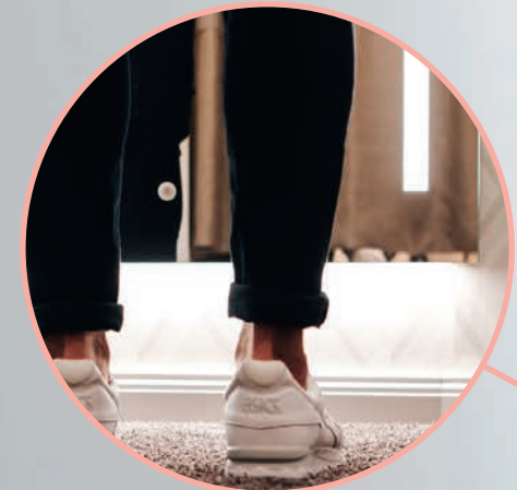
Perfectly illuminated from head to toe with extra long light panels

WORLD FIRST 1 mirror + 3x perfect lighting