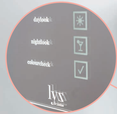
Touch control panel with switchable light options