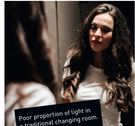
Poor proportion of light in a traditional changing room.